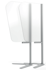
Transparent Perspex® Glass