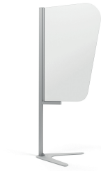
Effective Social Distancing Screens