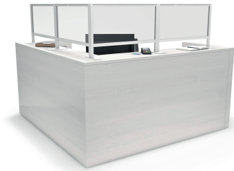
Effective Social Distancing Screens