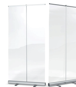
Clear Protective Screen Roller Banner