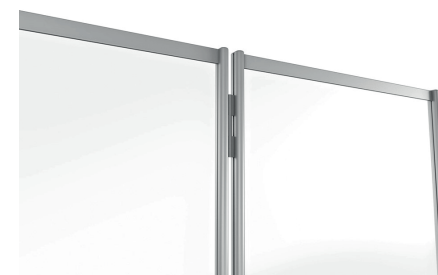
Panel Linking Kit Included