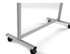
Mobile Room Divider Screen On Wheels