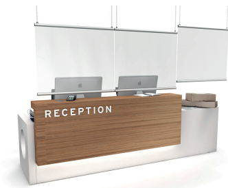
Hygienic, Wipeable Safety Screens