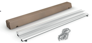
Mobile Screen Divider On Wheels