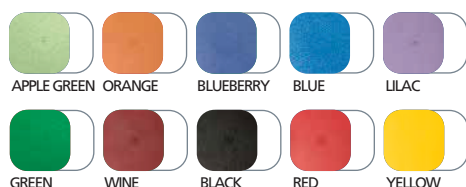
Table Material/Frame Information:

Gauge of Frame: 2mm. Diameter of Steel: 32mm. Paint: Powder Coated Scratch Resistant Grey.